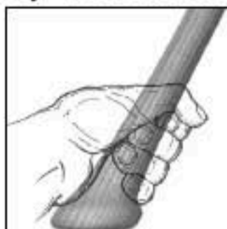
Pro-XR Angled Bat Knobs